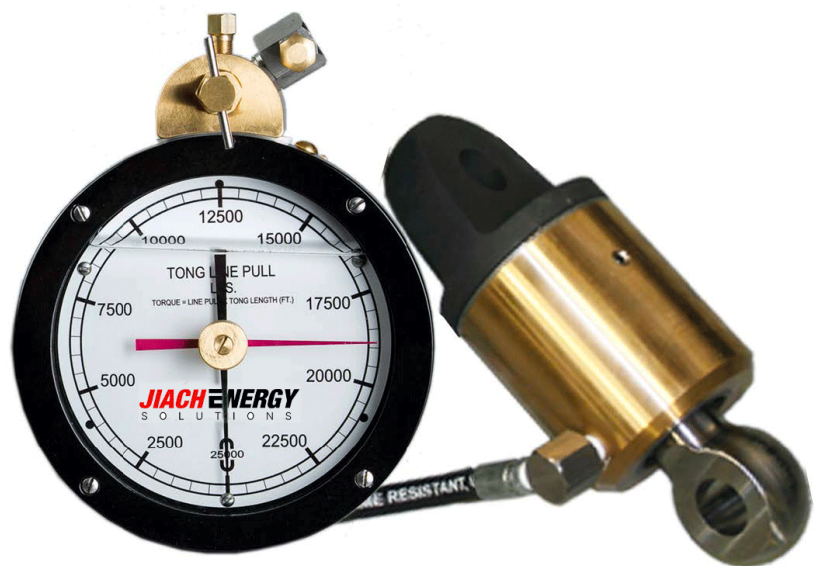
6" Tong Line Pull Gauge Box Mount with hose and Tension Piston Load Cell