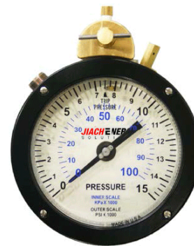
6" Pressure Gauge with Automatic Over-Pressure Shut-Down