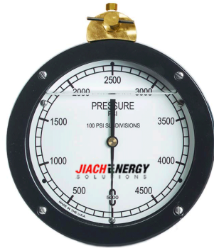
6" Pressure Gauge Box Mount

Jiach Energy Solution's single pointer pressure system is designed to provide a fast and precise check of pump pressure. This system can help detect mud pump operational problems, such as washed out drill pipe or bit nozzle problems. The system consists of a 6" pressure indicator, a standard 50 ft. high pressure hose, and is designed for use with a diaphragm protector, piston isolator, or deboster to separate well fluids from the system's internal parts.