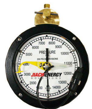
6" Pressure Gauge with Proximity Switch