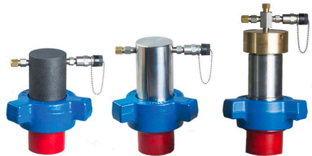
Diaphragm Protector, Piston Isolator or Debooster