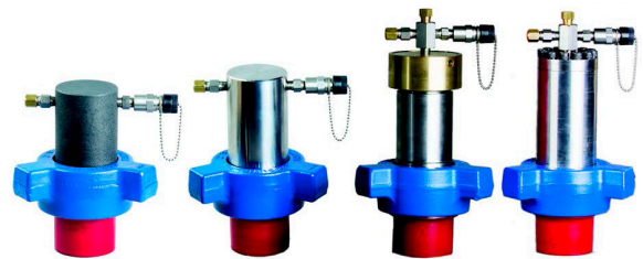
Sensor, Diaphragm Protector, Piston Isolator or Deboster