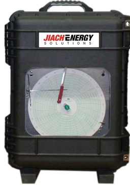
8" HD Chart Recorder

Jiach Energy Solution's "HD" Heavy-duty line of chart recorders are an accurate and reliable means for the measurement and recording of pressure in a variety of applications.